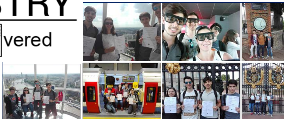
The winners of the 1 st Edition of Chemistry Rediscovered in 2016 from Portugal, on their victory trip to London!

Join us next year in celebrating one of the most significant events in the history of chemistry!