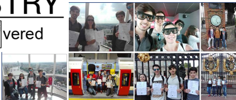
The winners of the 1 st Edition of Chemistry Rediscovered in 2016 from Portugal, on their victory trip to London!

Join us next year in celebrating one of the most significant events in the history of chemistry!